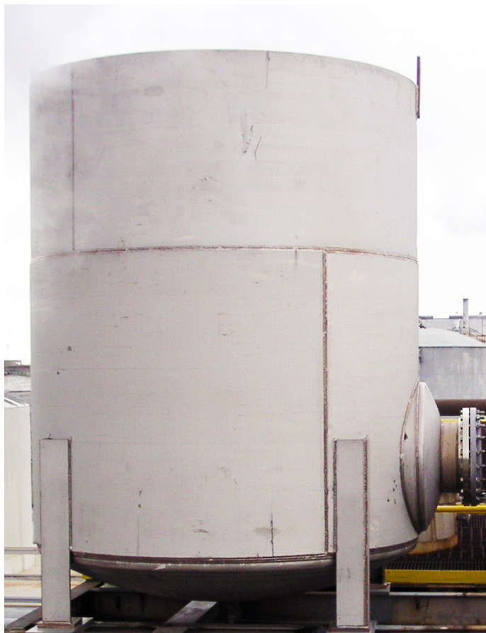
Vent silencer at a Midwest phosphorus plant